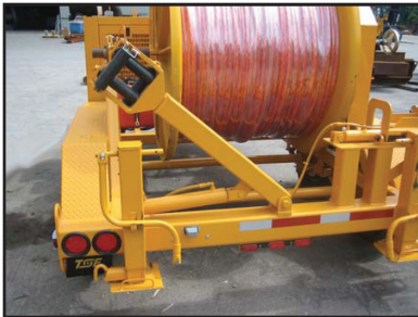
Hydraulically controlled levelwind