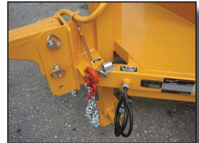
Adjustable, 4 position pintle hitch with safety chains and electrical breakaway switch to engage trailer brakes in case of hitch disengagement.