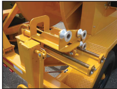
High speed levelwind for Polemaster™ system